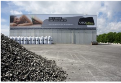
GEOCELL Manufacturing Plant