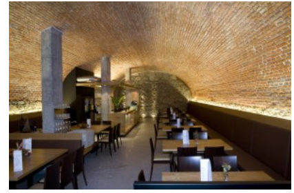
It's there, but you can't see it..