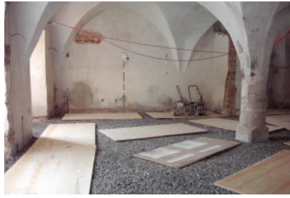
Glasscrete Floor Sub-base